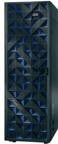
Figure 1. IBM PureData System

The new PureData System for Analytics takes the success of a proven platform and technology one step further. The new N2001 model was designed not only for performance, but for data center efficiency. Why? Because today’s world depends on more advanced analytics to gain a competitive edge. This increase in capability should come in a simple, agile, powerful system that is also highly efficient. The new PureData System for Analytics offers increased performance with no increase in power. All this comes with less floor space and less resources in the data center. That’s innovation, where it matters.